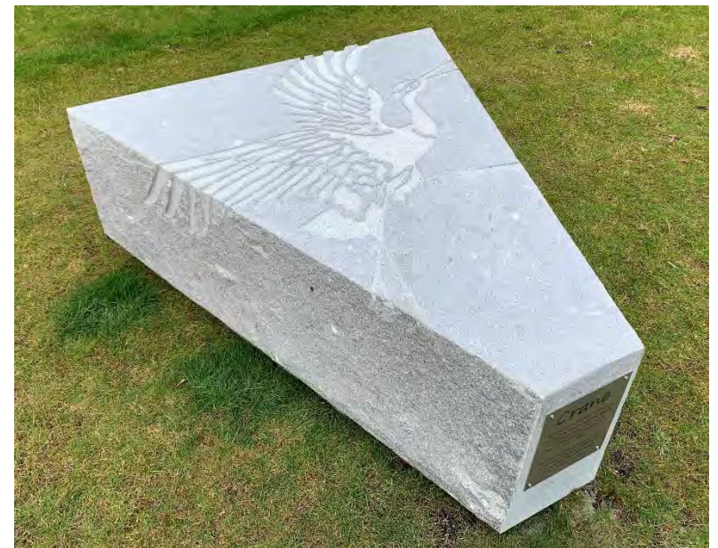
Carved Granite Seats CTS Client: Bloor Homes South Midlands Carved granite seat platforms for a new build housing development in Cranfield, Bedfordshire.