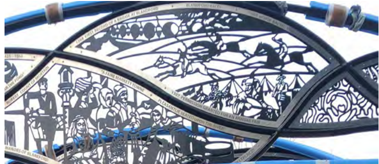
Badbury Heights Heritage Benches & Canopy Client: Blandford Forum Town Council PROJECT IN PROGRESS AWAITING SURFACING WORKS