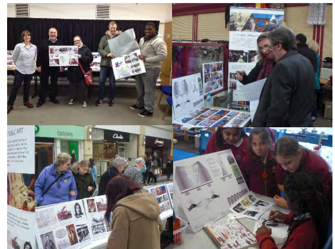
Stockport Interchange Heritage Panels Client: TfGM Four Exhibition Panels showing Stockport notables, along with the research and community engagement process, funded by Heritage Lottery Fund (HLF), that is to inform artist Tim Ward's designs for public art in the new build interchange scheme in the centre of Stockport.