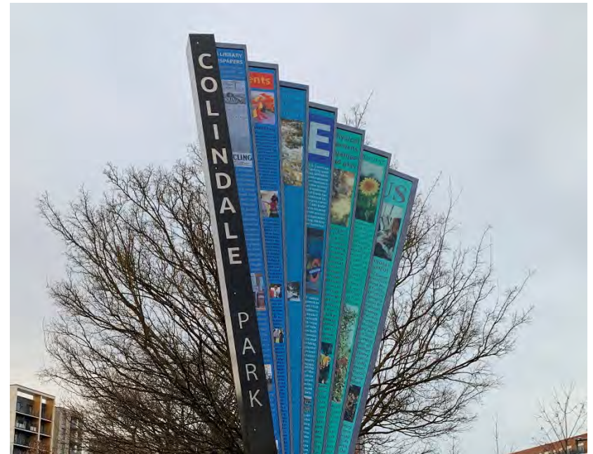
Newspaper Fans Colindale Park, Barnet, London Client: LB of Barnet

Two entrance markers for the regenerated Colindale Park. The concept for these 6.5m tall fans originated from opening or folding out of newspapers and magazines at the former British Library Newspaper Library once located on this site in Colindale.