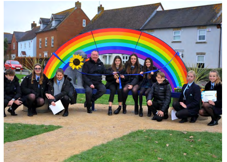
Angmering Public Art Client: Artsworld, Arun District Council & Angmering Parish Council Circling the Square enabling project, working with pupils of Angmering School to facilitate their design of this distinctive piece of public art for outside Angmering Community Centre.