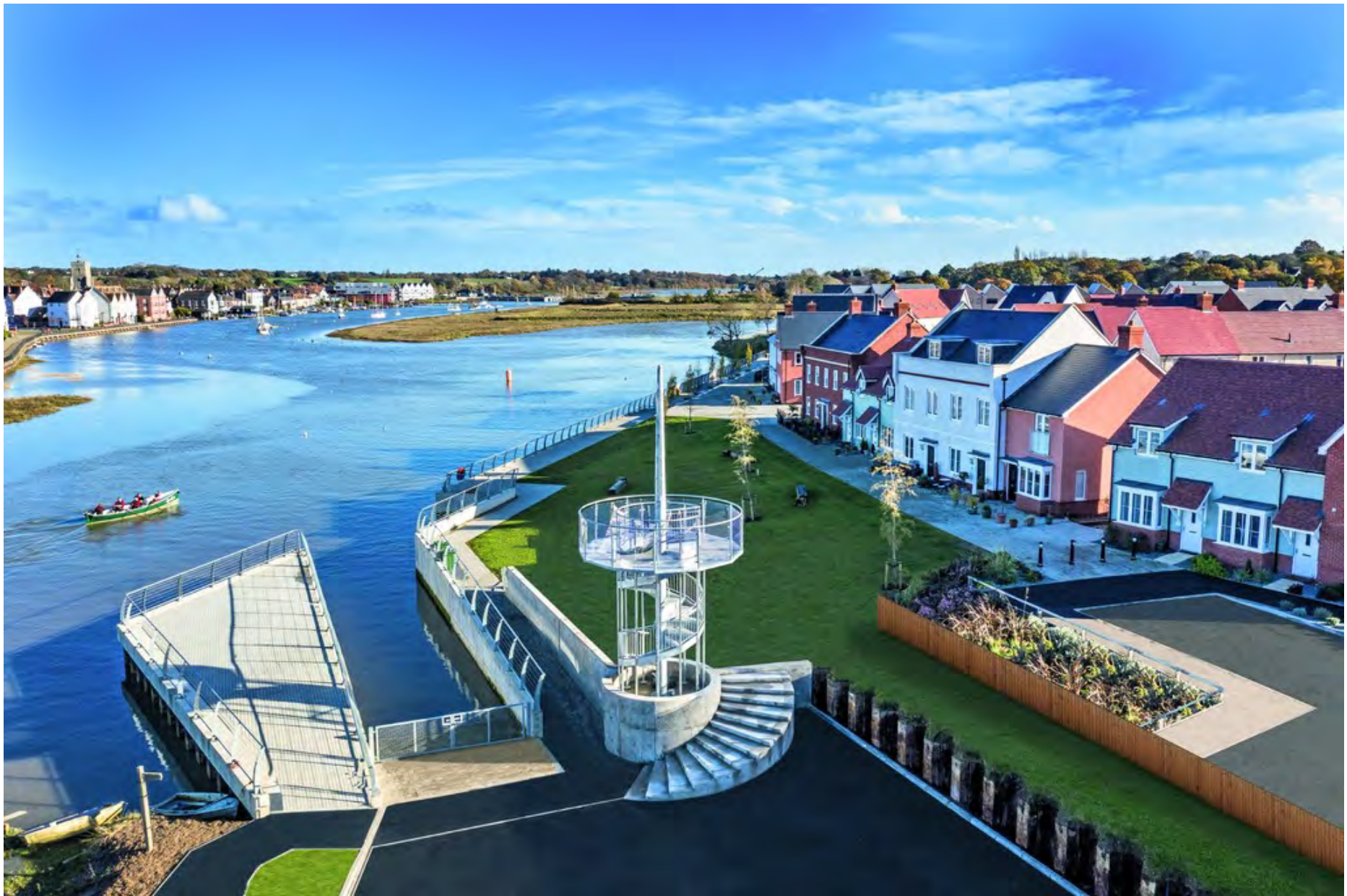
Rowhedge Wharf Watchtower, Rowhedge, Colchester, Essex